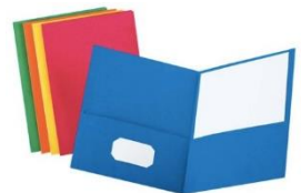
2 Regular folders