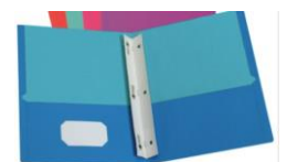
.... & 2 w/ fasteners